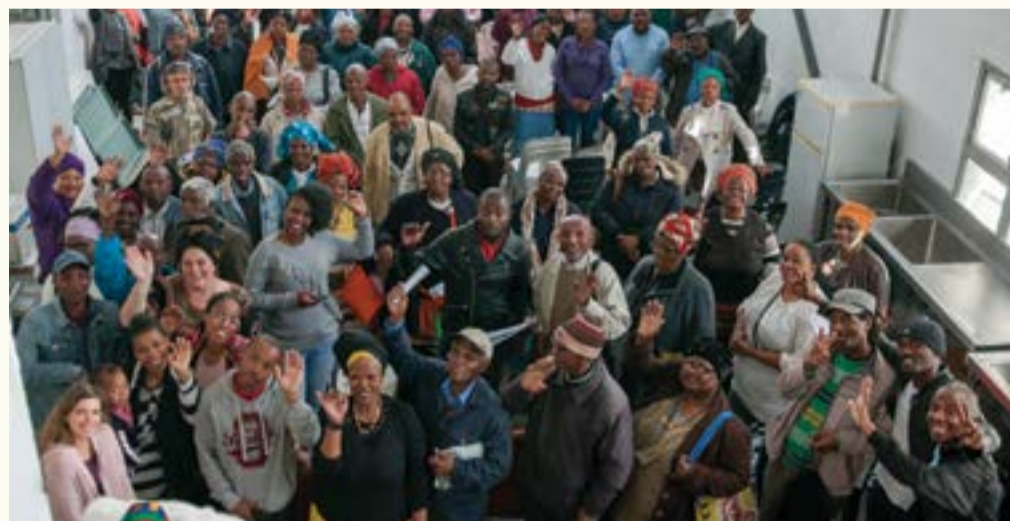
Abalimi staff and farmers get together at the new pack shed

This meeting focused on how Abalimi and the farmers can move forward, especially with re-starting the Harvest of Hope box deliveries, which were temporarily on hold while Abalimi was restructuring. The farmers