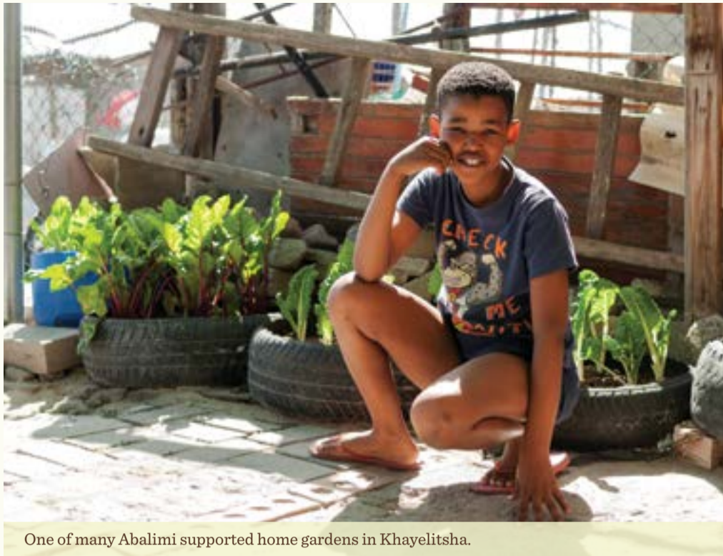
One of many Abalimi supported home gardens in Khayelitsha.