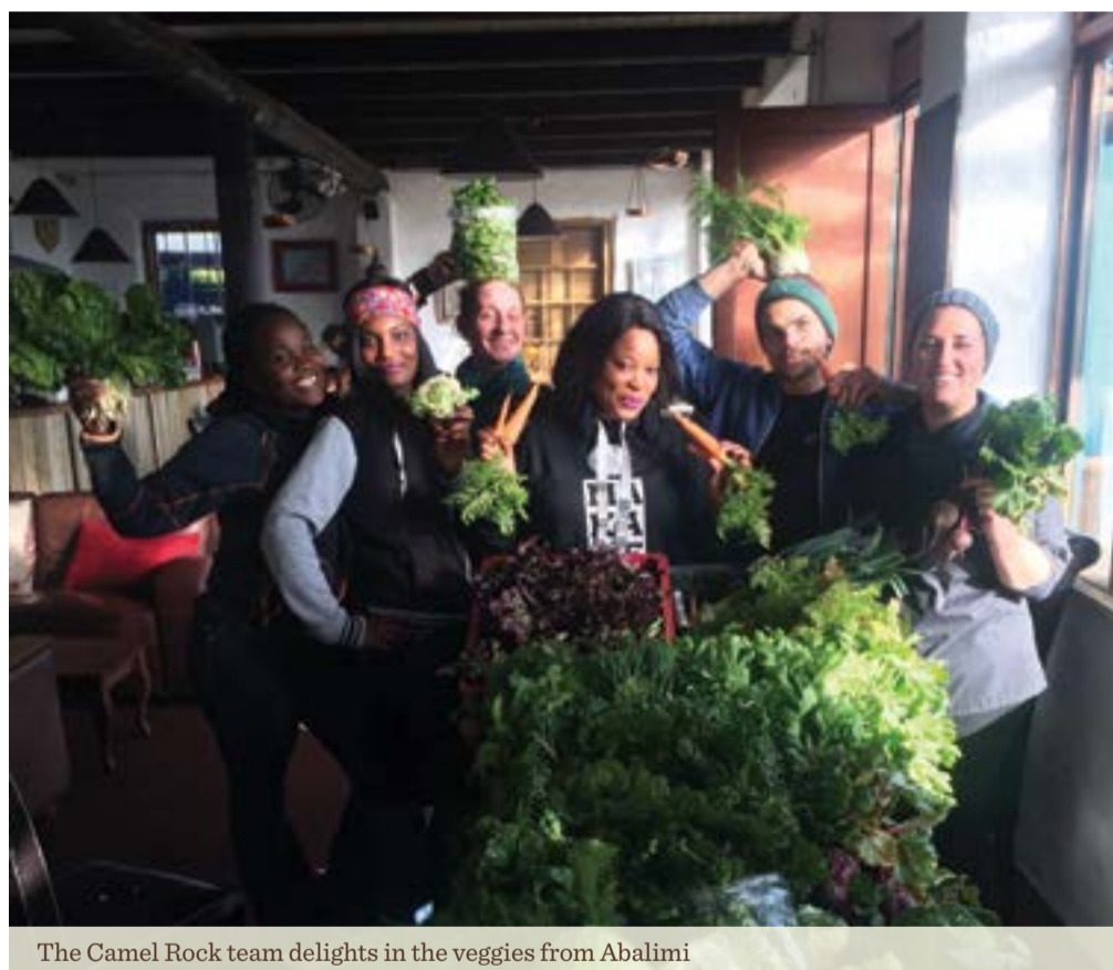
The Camel Rock team delights in the veggies from Abalimi